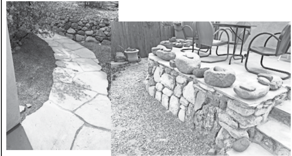
Projects include: Biosphere 2 · Catalina Scenic Highway: Windy Point / Seven Cataracts / Aspen View Coronado National Forest: Sabino, Molina & Madera Canyon / Prison Camp Historic Monument Numerous Oracle Patios