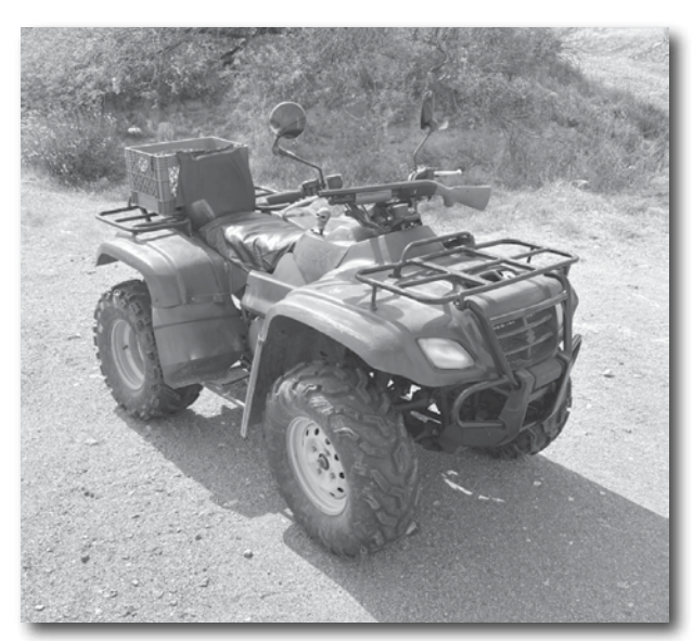
The ATV with the cap gun that triggered a lock down at the Hayden-Winkelman Schools.

The male subject was contacted and questioned about the weapon. It was determined that the shotgun was not an operable shotgun, but rather a plastic simulated "cap-gun" that makes loud "electric-pop" sounds when triggered. The subject, an 84-year-old local resident, was released at scene without incident. Charges of interference with or disruption of an educational institution (ARS 13-2911) have been submitted to Gila County Attorney's Office for review in this case.