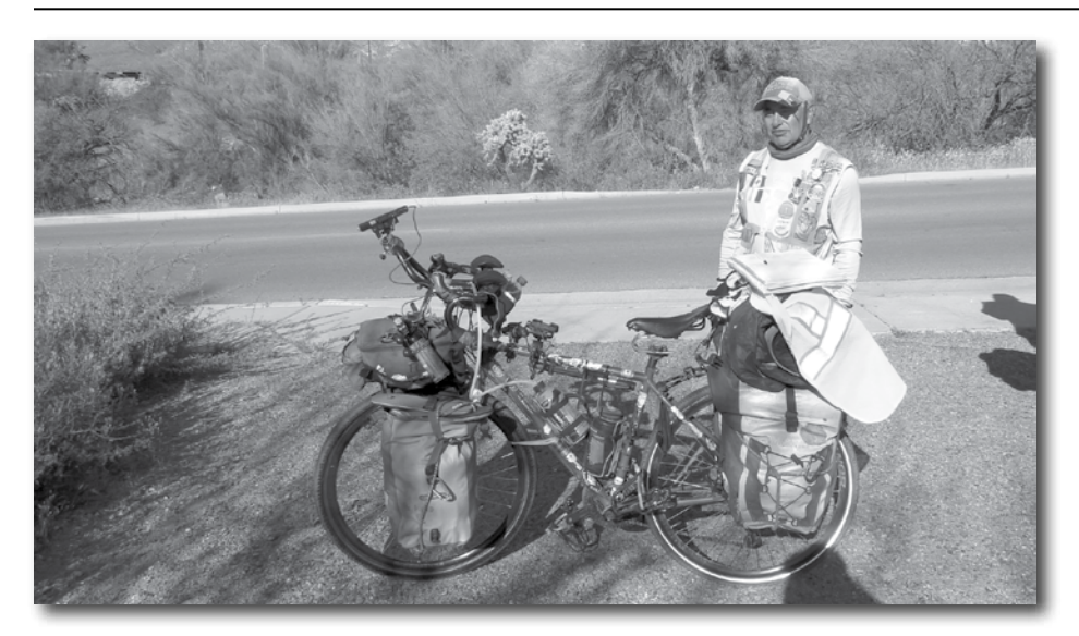
Mario wouldn't walk 1,000 miles but he'd pedal 10K-plus!