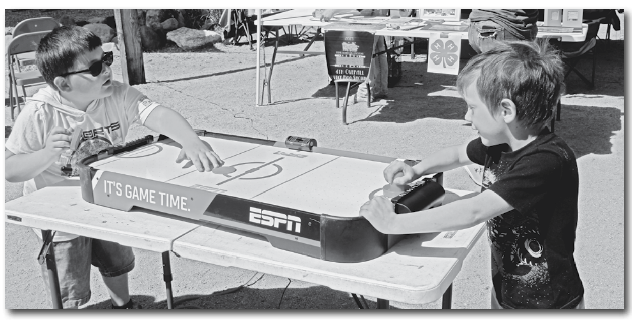
There will be fun for the whole family at this year's Oracle Oaks Festival.

• Mount Vista K-8 & Oracle School District