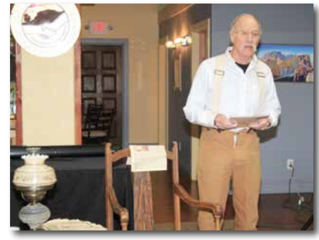
The Superior Chamber of Commerce hosted the 16th Annual Superior Home Tour & Antique Show, Jan. 27 and 28. The event offered visitors a chance to explore several unique homes in the historic community. Above are photos from the Sunday activities at the Home Tour.