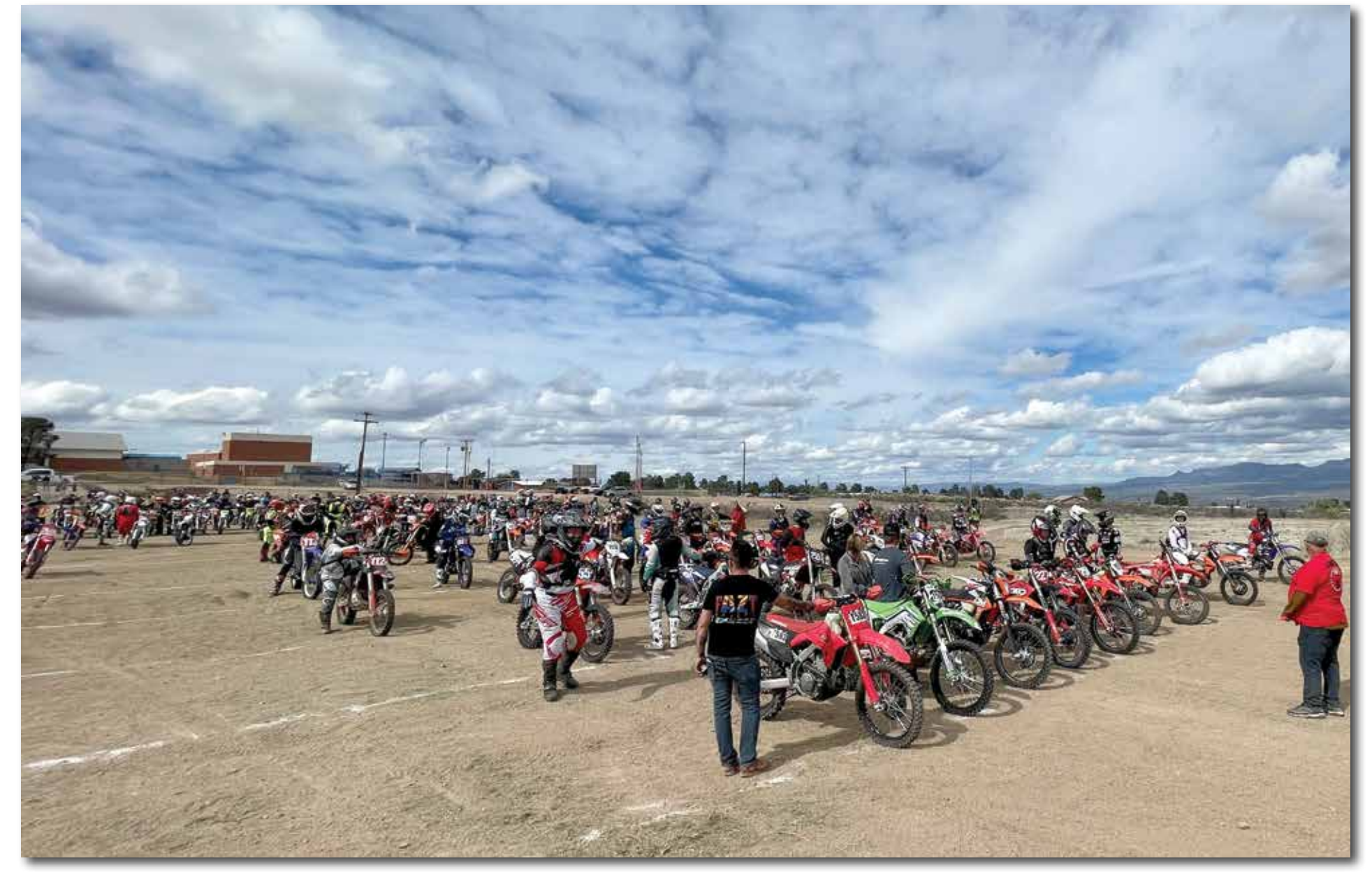
A view of racers lining up for the 2023 Copper Classic.

Preparations for the event are well underway now. On Thursday, March 7, set-up of the race campus will begin. Racing begins on Saturday, March 9, starting with Mini races at 8:30 a.m. The Big Bike racing will be starting around the noon hour. Please pay attention to and honor the road closure barriers and safety cones in and around Avenue D and Erickson Streets during these hours.