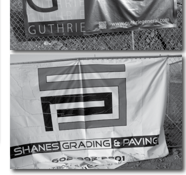
The building site for the new clinic in Kearny is being prepped for the first round of construction. The clinic is under the ownership of the Cobre Valley Regional Medical Center.