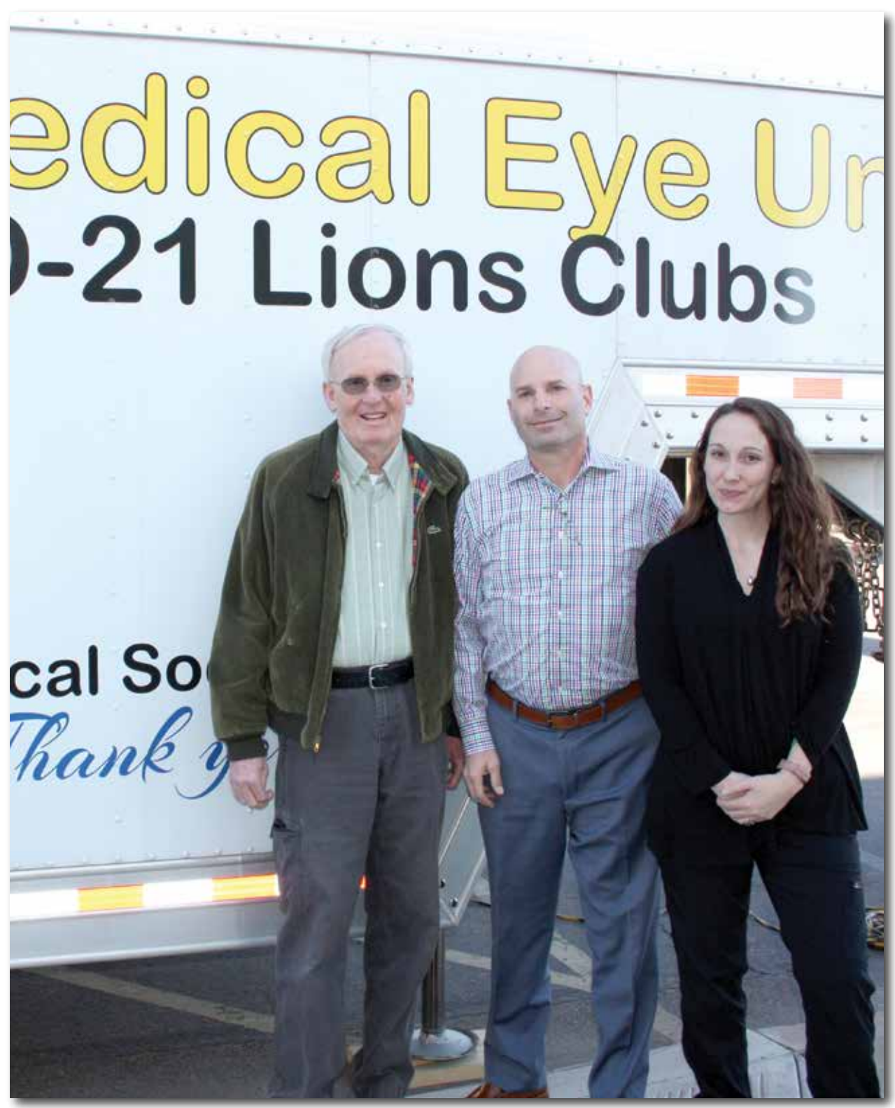
The Lions Club Arizona Medical Eye Unit will be in Kearny on Jan. 29.

Sponsors of the Arizona Medical Eye Unit in Kearny are the Kearny Women's Club. This organization is in charge of all arrangements and appointments. The fee per patient is $40 cash.