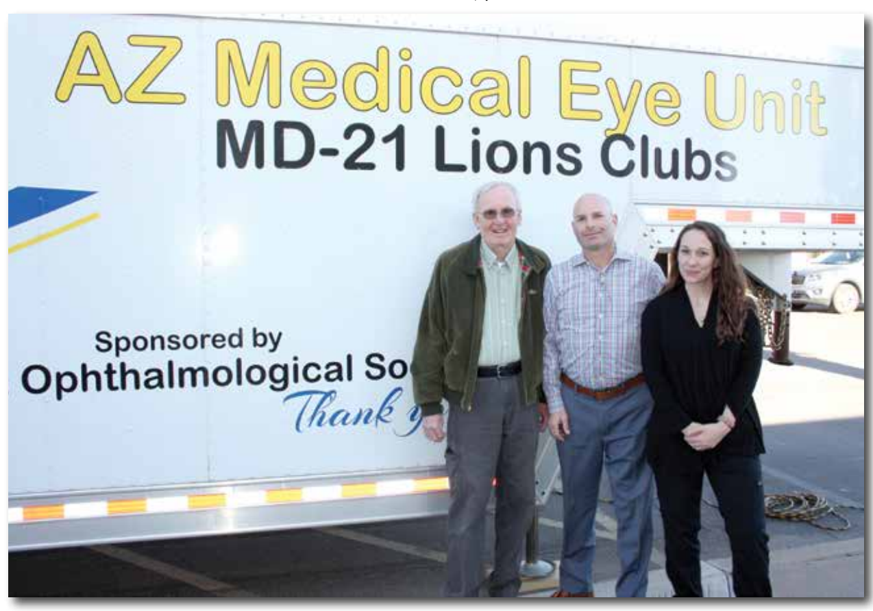
The Lions Club Arizona Medical Eye Unit will be in Kearny on Jan. 29.

Sponsors of the Arizona Medical Eye Unit in Kearny are the Kearny Women's Club. This organization is in charge of all arrangements and appointments. The fee per patient is $40 cash.