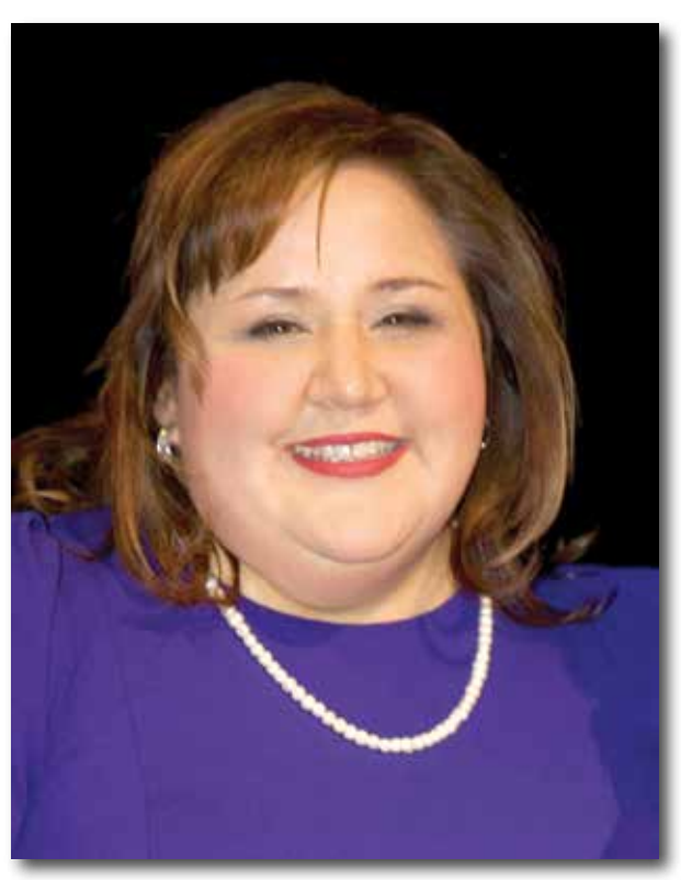
Mayor Mila Besich