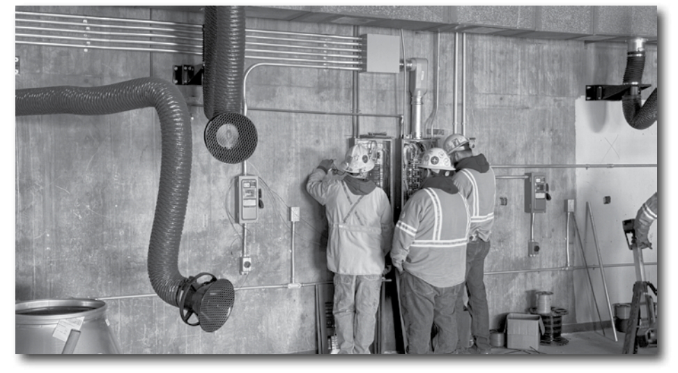
Electricians work to complete the new Welding facility at the Superior Multi-Gen Mila Besich | CANP