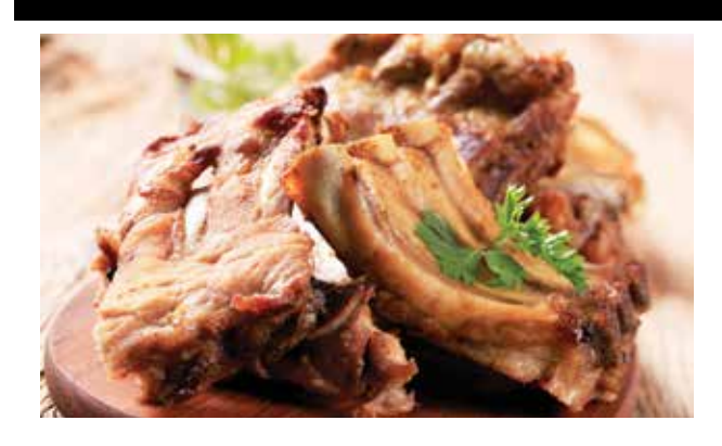
Pork Spare Ribs Medium Tender Slabs