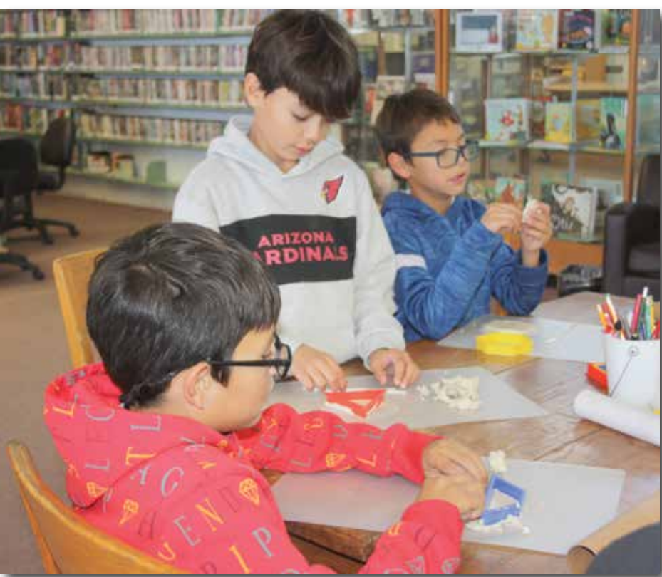
The Hayden Library hosted the first of two STEAM for Kids: Clay events on Friday, Jan,. 12. Kids attending worked with air-dry clay designing little cups and other trinkets. They will paint their creations at the second event on Jan. 26. The event was sponsored by the University of Arizona's Center for Rural Health. A great time was had by all.