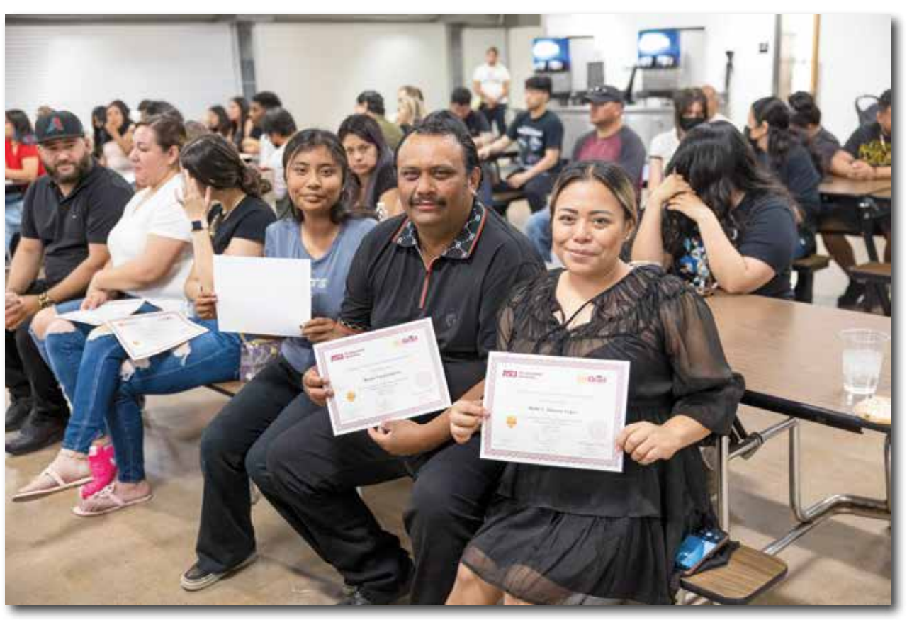
WeGrad participants' graduation.

As kids develop, the discussions can certainly become more complex and build upon the foundational knowledge already shared. The goal is to make education, and a trusted relationship between parent and child, the cornerstones of painting a successful future together. To help shape your child's educational future, enroll in WeGrad today. With a curriculum delivered via text messages suited for elementary, middle and high school families, it's a simple and efficient way to support your student's academic journey. Visit WeGrad.asu.edu/digital to sign up or learn more.