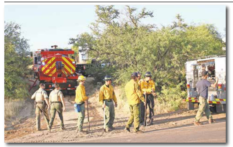
In July, Oracle Firefighters along with a visiting fire crew worked a fire made more difficulty with the overgrowth around the property. The Home Ignition Zone will teach homeowners how to avoid this situation.