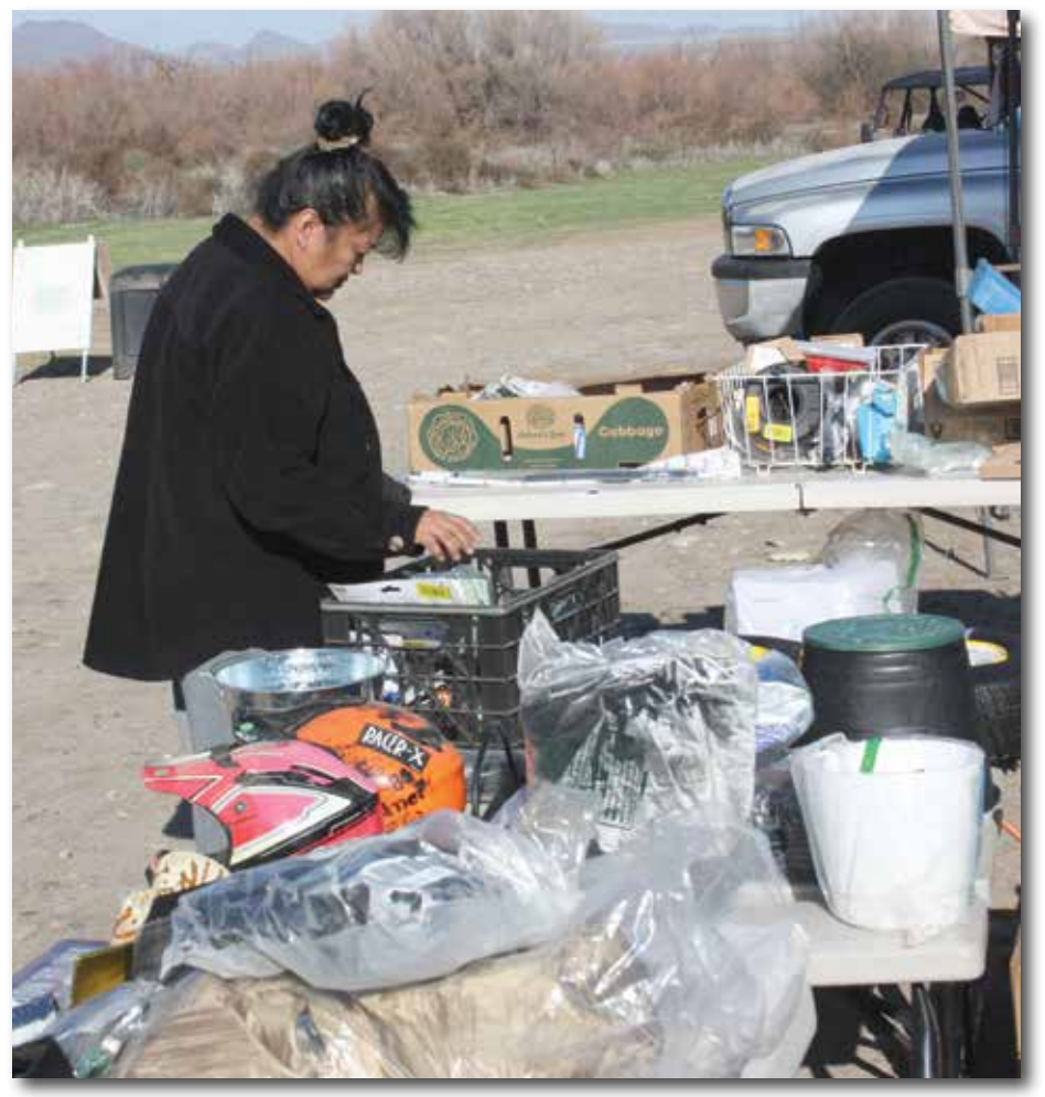
The General Kearny Sheriff's Posse held a swap meet Saturday at the Blake Arena. The weather was a little cold, but it was a sunny day for the event which is held the first Saturday of each month. The next swap meet is scheduled on Feb. 3. See more photos on Page 16.