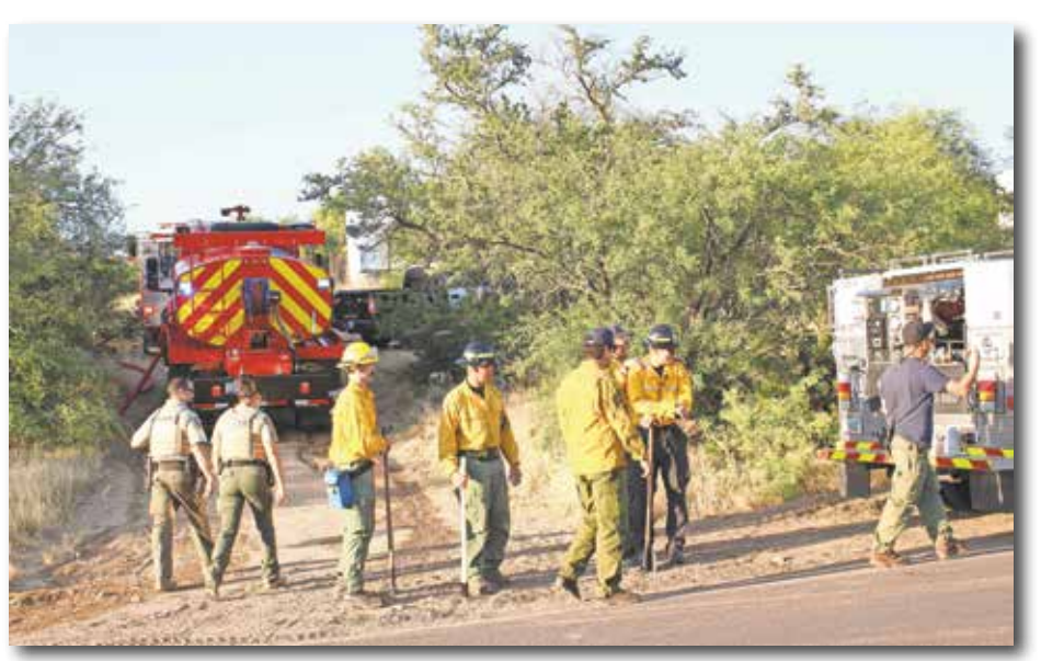
In July, Oracle Firefighters along with a visiting fire crew worked a fire made more difficulty with the overgrowth around the property. The Home Ignition Zone will teach homeowners how to avoid this situation.